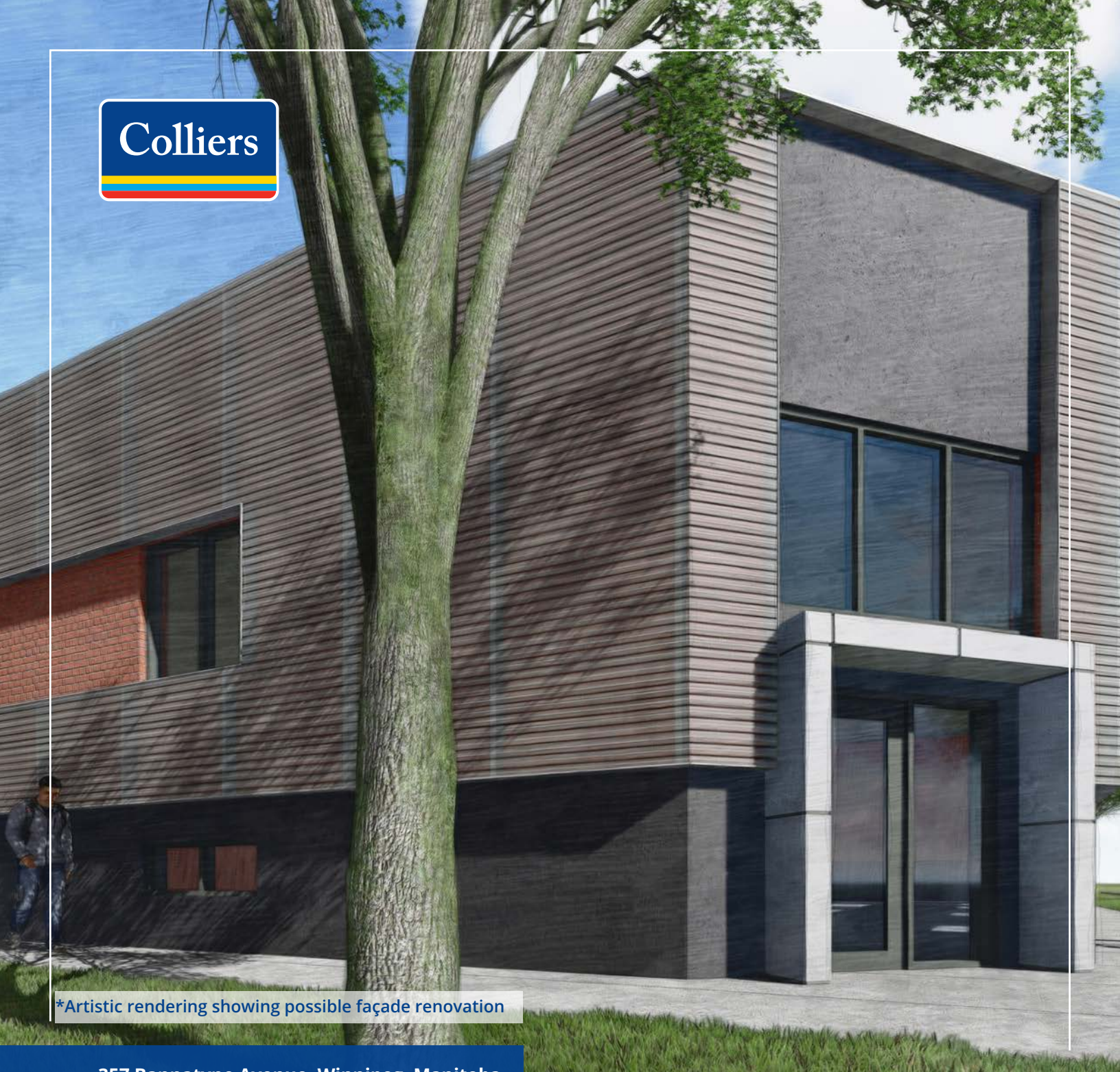
*Artistic rendering showing possible façade renovation

357 Bannatyne Avenue, Winnipeg, Manitoba